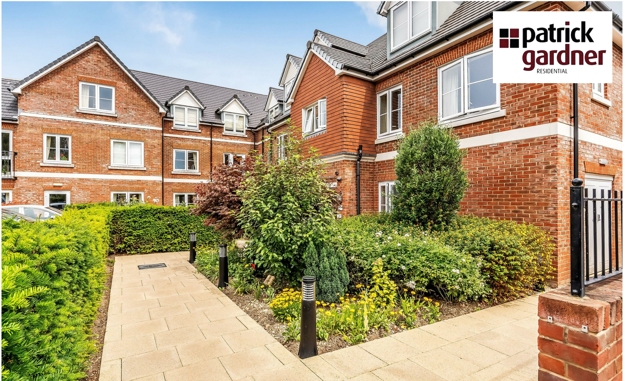
Flat 18, Headley Lodge Leatherhead Road, Ashted, Surrey, KT21 2TP