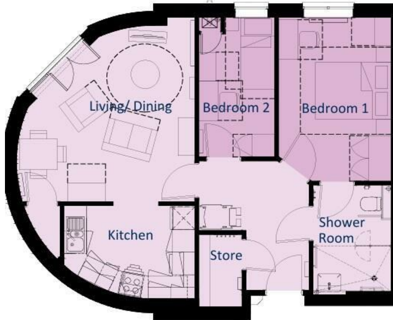
TYPE G 2 BED APARTMENT 66.6 sq.m 717 sq.ft