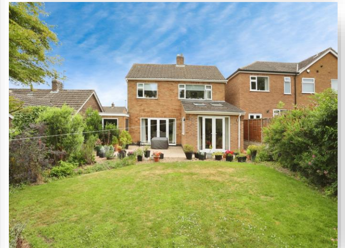
Bleakmoor Close, Rearsby