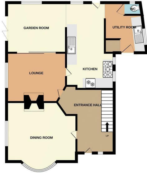
GROUND FLOOR 730 sq.ft. (67.8 sq.m.) approx.