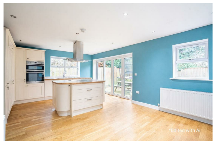
*Edited with AI