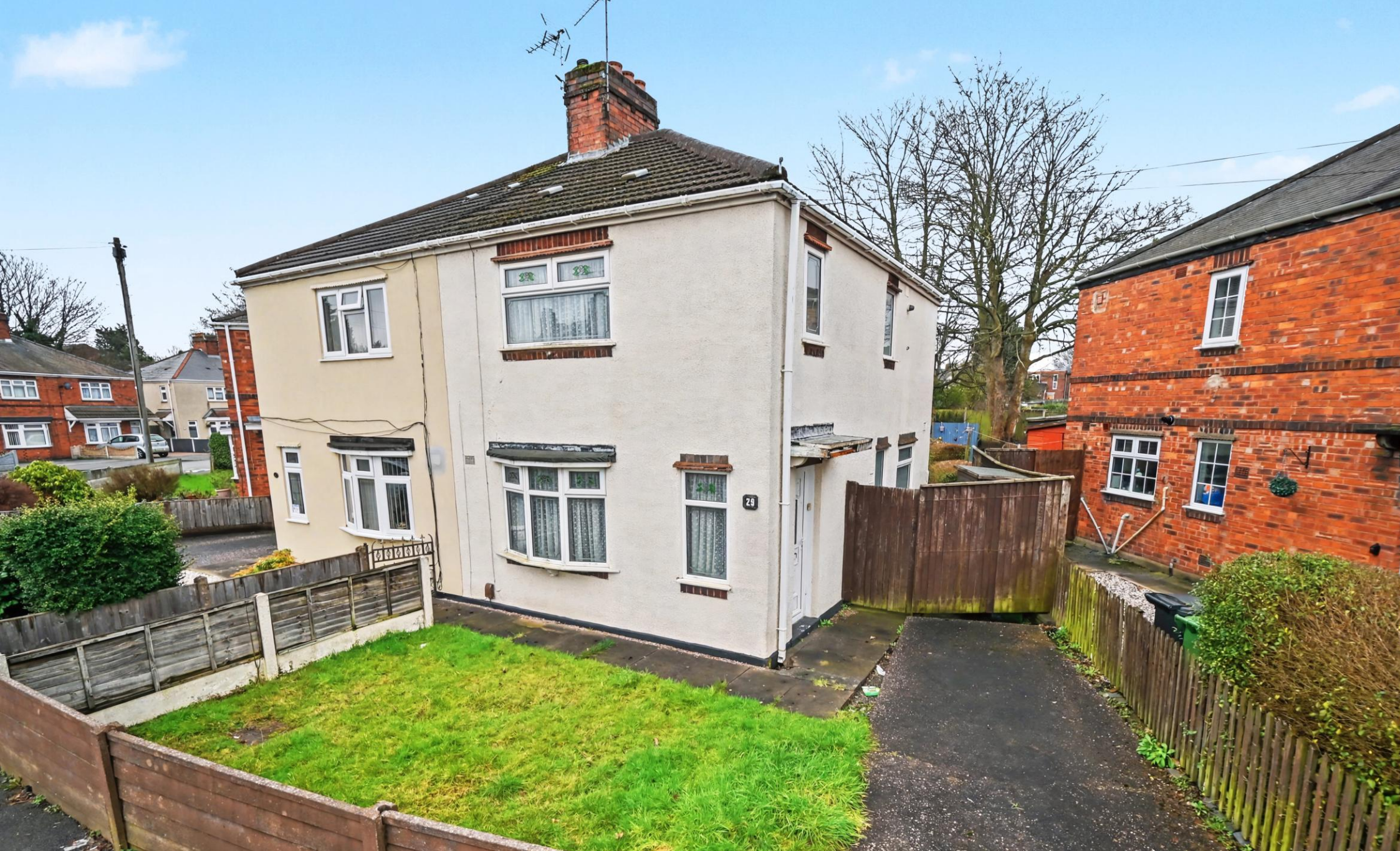
29 Albany Crescent, Bilston