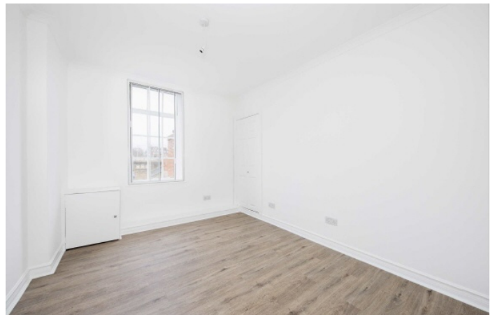
Kensington High Street, W8