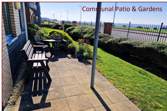
Communal Patio & Gardens