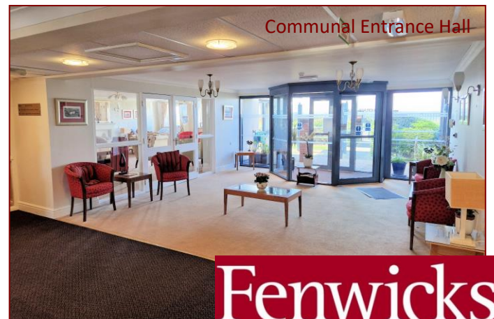
Communal Entrance Hall