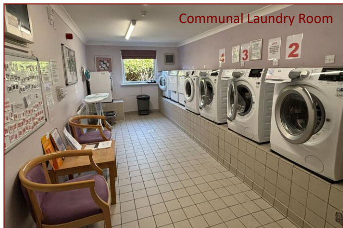
Communal Laundry Room