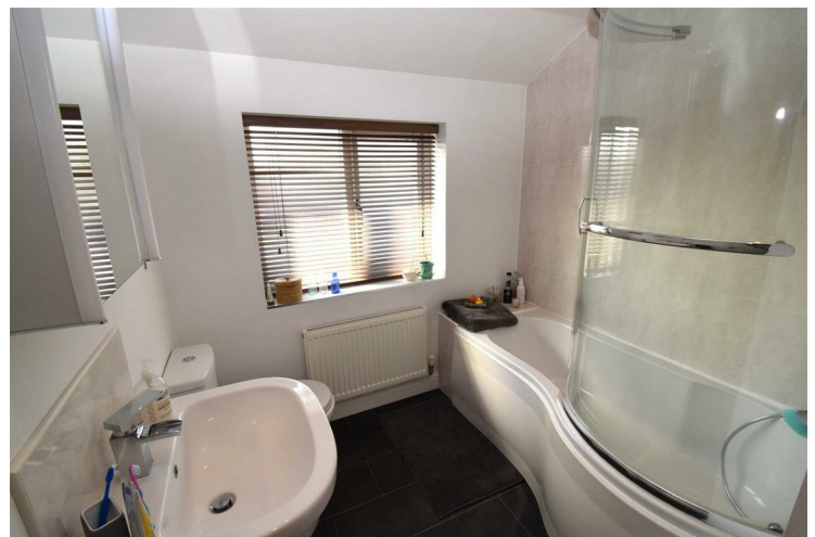
Family Bathroom 7'2" x 6'3" (2.20 x 1.91)

Three piece suite comprising P-shape bath with a shower attachment and screen; wash hand basin and WC. Ceiling spotlights, an extractor vent, radiator and double glazed front window.