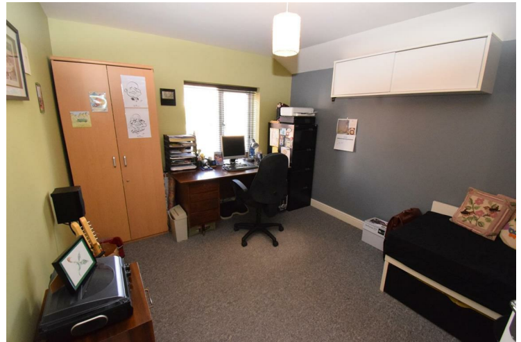
Bedroom 4/Study 12'2" x 9'10" max. (3.73 x 3.02 max.)

With a radiator and double glazed side window.