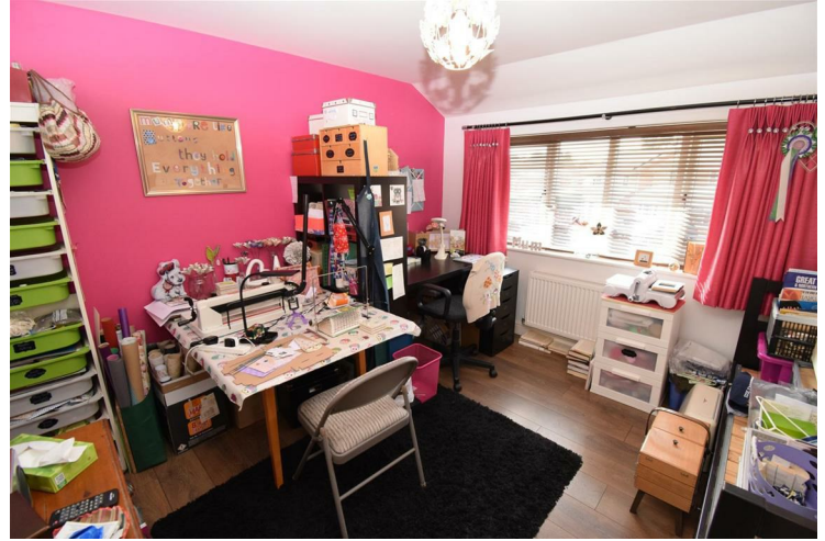
Bedroom 3 11'3" x 11'2" (3.44 x 3.42)

With laminate flooring, a radiator and double glazed front window.