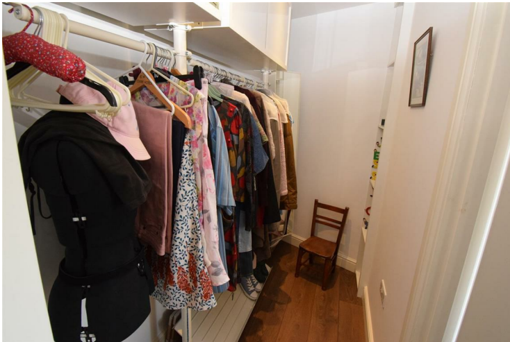
Dressing Area 7'8" x 4'0" (2.35 x 1.24)

Walk in style wardrobe with laminate flooring, ceiling spotlights and a door to: