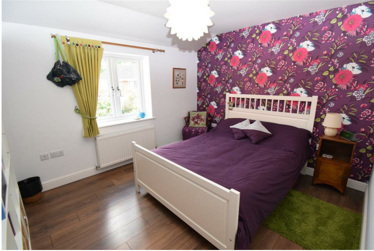
Bedroom 2 11'9" x 9'11" (3.59 x 3.03)

With laminate flooring, a radiator and double glazed rear window. Display shelving and drawers and opening to: