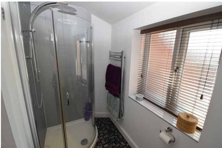
En-Suite Shower Room 8'3" x 4'3" (2.52 x 1.31)

Three piece suite comprising shower, wash hand basin and WC. Heated towel rail, ceiling spotlights, an extractor vent and a double glazed front window.