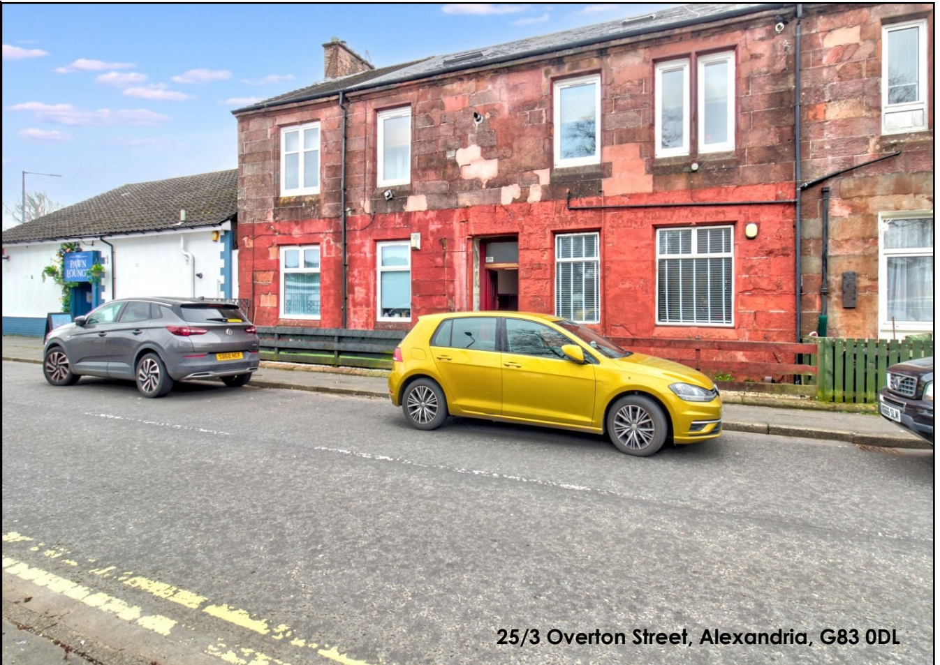
25/3 Overton Street, Alexandria, G83 0DL

The agents present to the market this spacious one-bedroom first-floor flat, forming part of a traditional tenement block just a short walk from the main street, local shops, and public transport links.