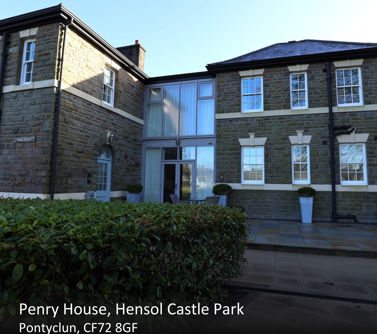
Penry House, Hensol Castle Park Pontyclun, CF72 8GF