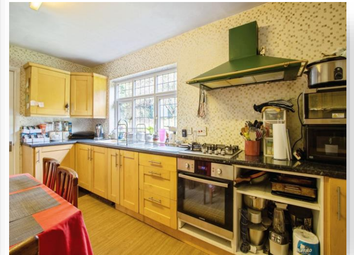
Rein Court, Aberford Leeds LS25 3BS