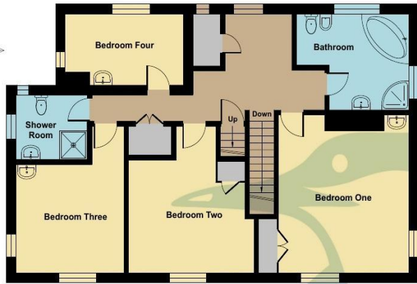
FIRST FLOOR Approx. 1068 SQFT (INTERNAL)