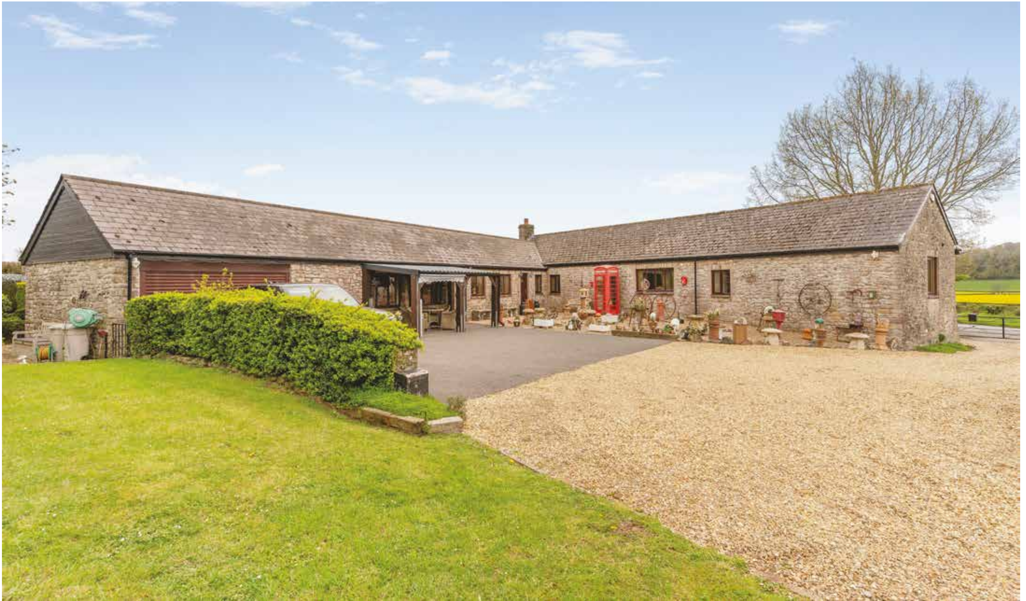
Old Gunters Barn Caerwent | Caldicot | Gwent | NP26 5BA