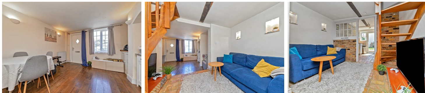
Ground Floor Approx. 268.8 sq. feet

Nestled in the charming village of Sandridge, St. Albans, this delightful two-bedroom terraced cottage offers a perfect blend of character and modern living. Located on the High Street, the property is ideally situated to enjoy the tranquil atmosphere of village life whilst being convenient for the vibrant amenities of St. Albans. Upon entering, you will be greeted by a warm and inviting reception room that showcases the cottage's unique character features, creating a cosy and welcoming environment. The lounge/diner leads onto the kitchen. On the first floor, there are two bedrooms and a bathroom. Outside, there is a pleasant rear garden. One of the standout features of this cottage is its proximity to the stunning Heartwood Forest, offering residents the opportunity to enjoy picturesque walks and the beauty of nature right on their doorstep. With no upper chain, this property presents an excellent opportunity for those looking to move in without delay. Whether you are a first-time buyer or seeking a charming home in a desirable location, this cottage is sure to impress. Embrace the village lifestyle and make this lovely home your own.