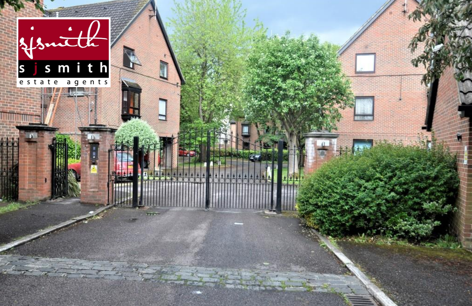
60 THE OAKS , MOORMEDE CRESCENT, STAINES-UPON-THAMES, TW18 4SG £875 PCM