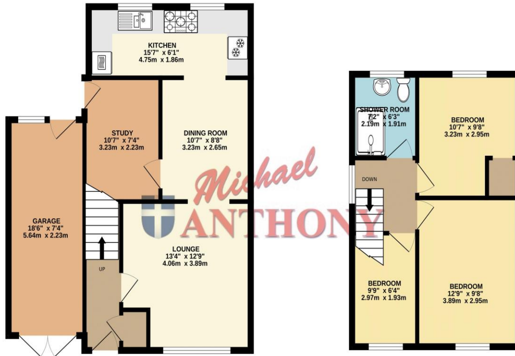
1ST FLOOR 374 sq.ft. (34.7 sq.m.) approx.

TOTAL FLOOR AREA: 977 sq.ft. (90.8 sq.m.) approx.