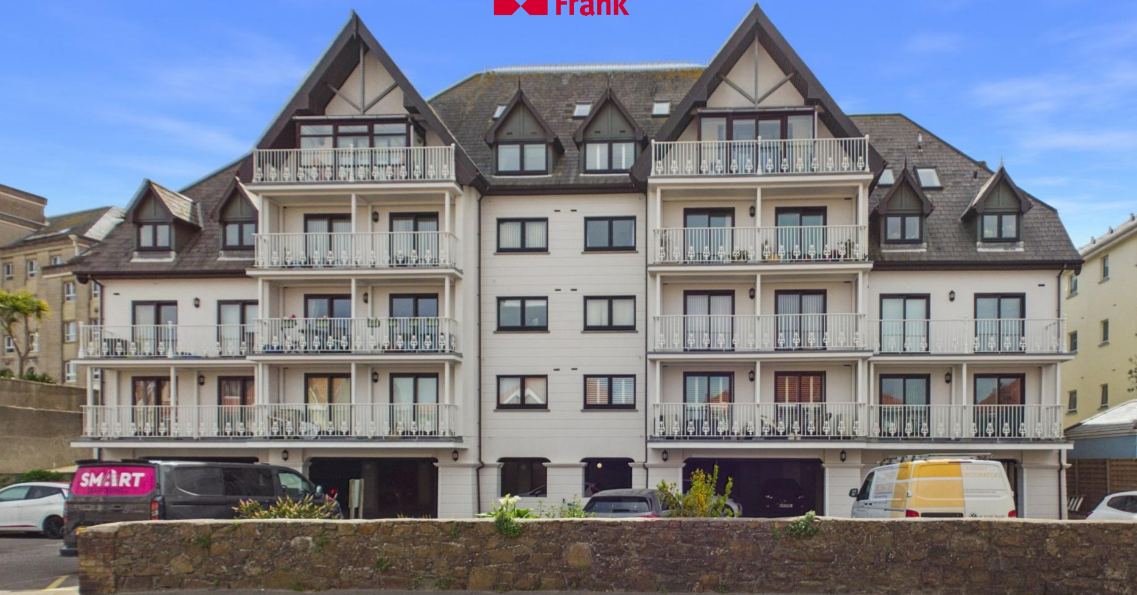
19 La Mondine