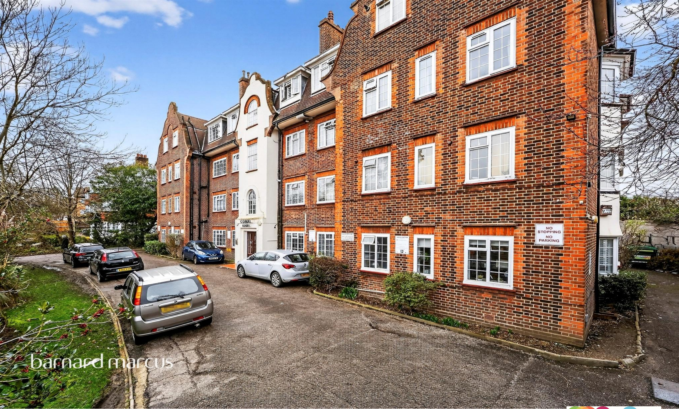
Conal Court Mitcham Lane, London SW16 6LN