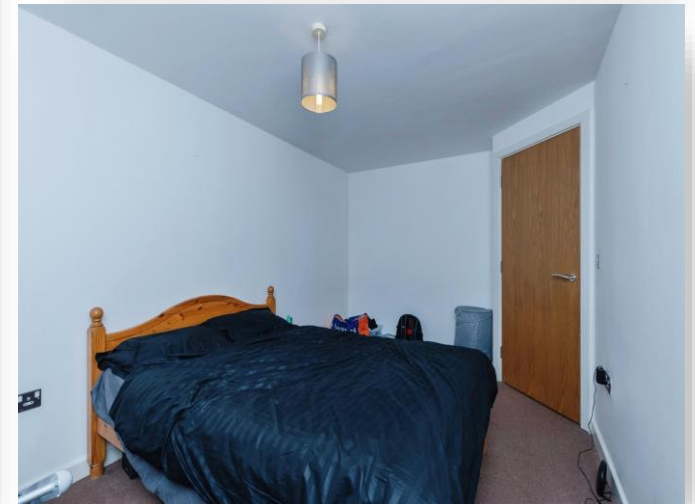
Sandhills Avenue, Hamilton Leicester LE5 1PL