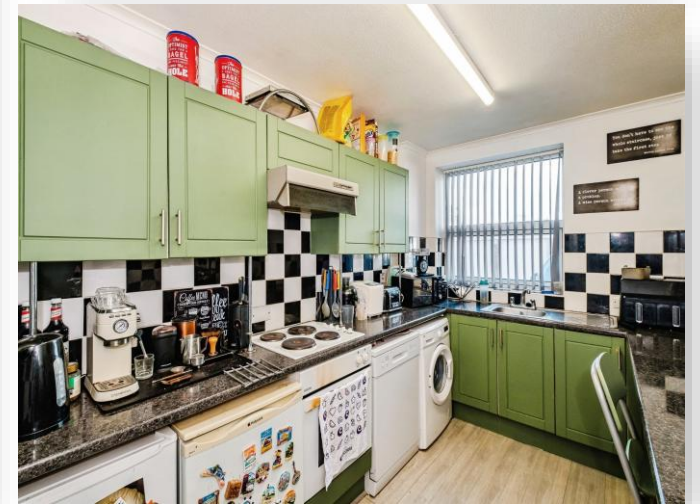
Milford Court Brighton Road, Lancing BN15 8RN