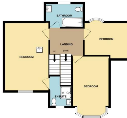
1ST FLOOR 690 sq.ft. (64.1 sq.m.) approx.