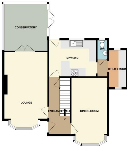
GROUND FLOOR 857 sq.ft. (79.6 sq.m.) approx.