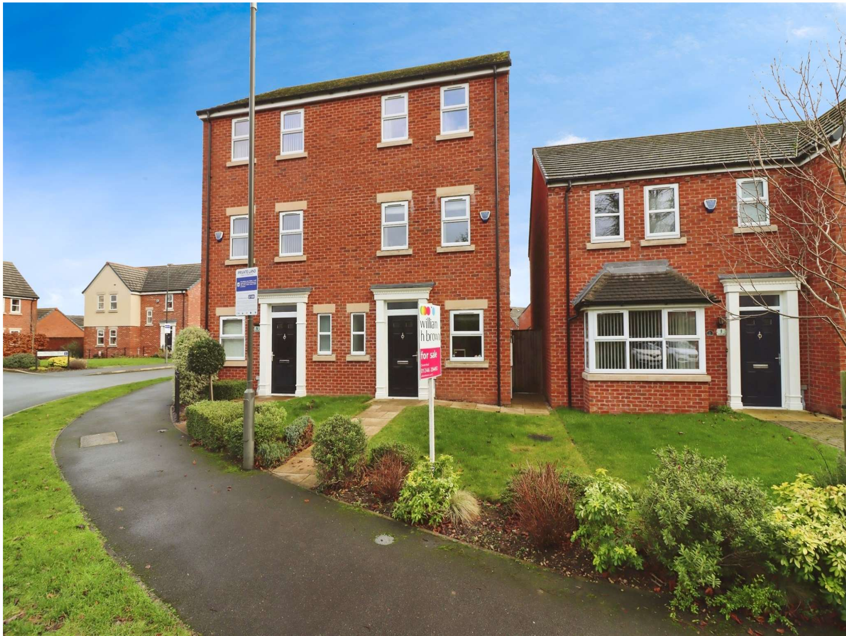
Hunters Walk, Chesterfield S40 1GB