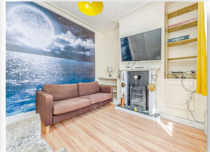
Pearl Street, Splott Cardiff CF24 1HB