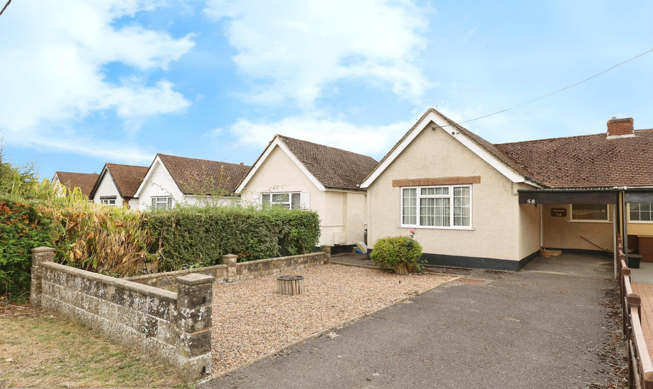
Asheridge Road, Chesham HP5 2PY