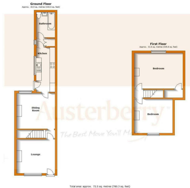
Total area: approx. 72.5 sq. metres (780.3 sq. feet)

To arrange a viewing or for any further information, please contact Austerberry on 01782 594595 or e-mail enquiries@austerberry.co.uk