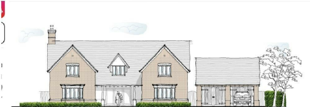
Illustrative Street Scene of Proposed Self Build Dwelling