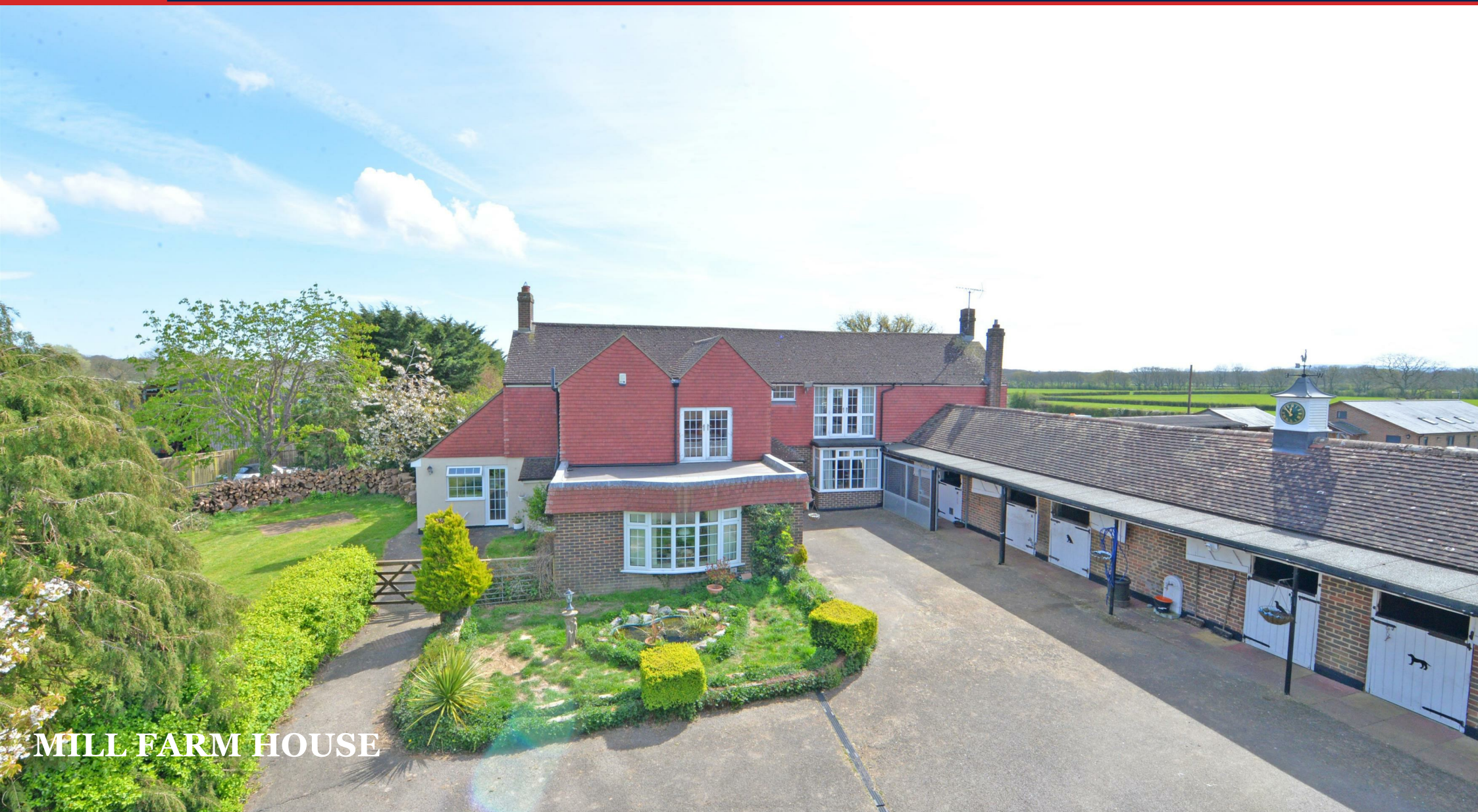
MILL FARM HOUSE