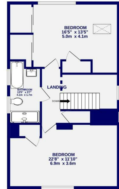
1ST FLOOR 732 sq.ft. (68.0 sq.m.) approx.