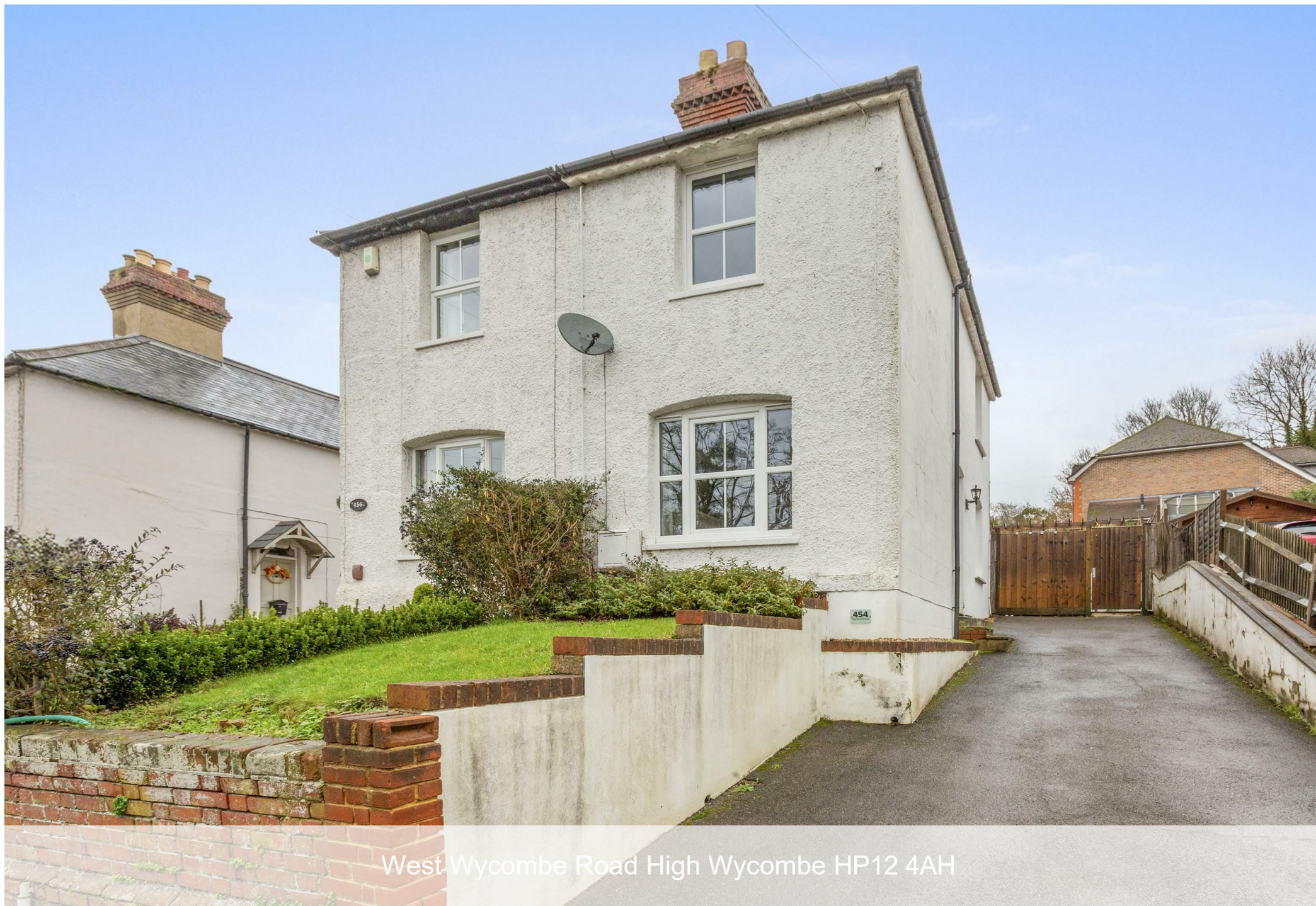
West Wycombe Road High Wycombe HP12 4AH