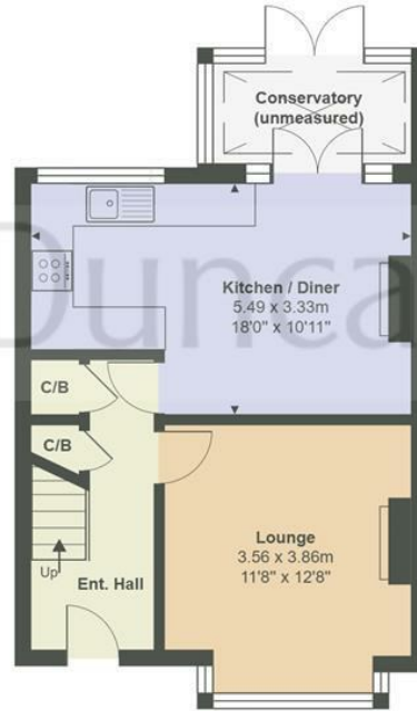
Ground Floor Area: 43.3 m 2 ... 466 ft 2