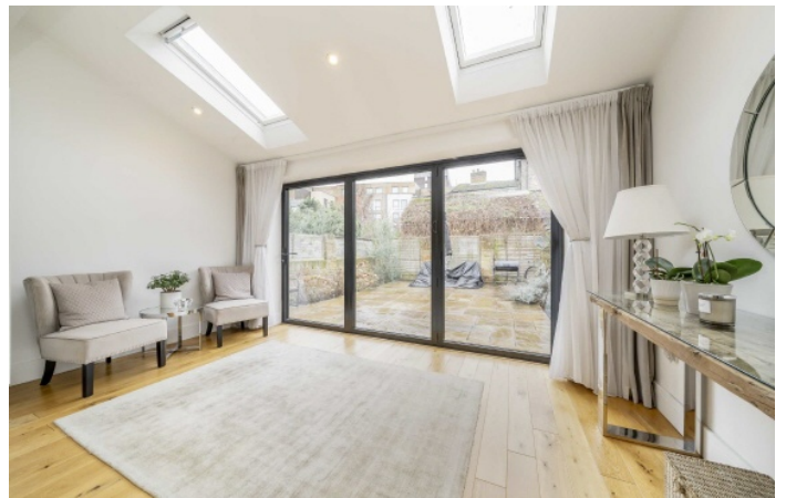
Grange Road, KT1