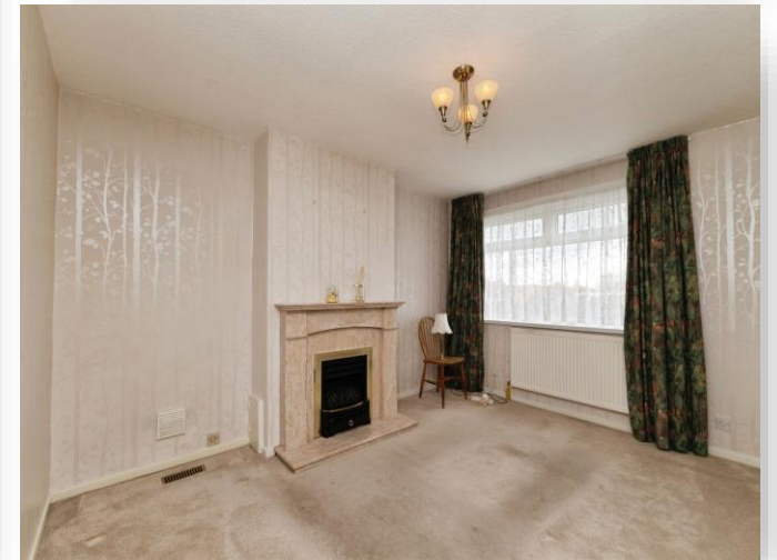
Wetherby Green, Ormesby Middlesbrough TS7 9LD