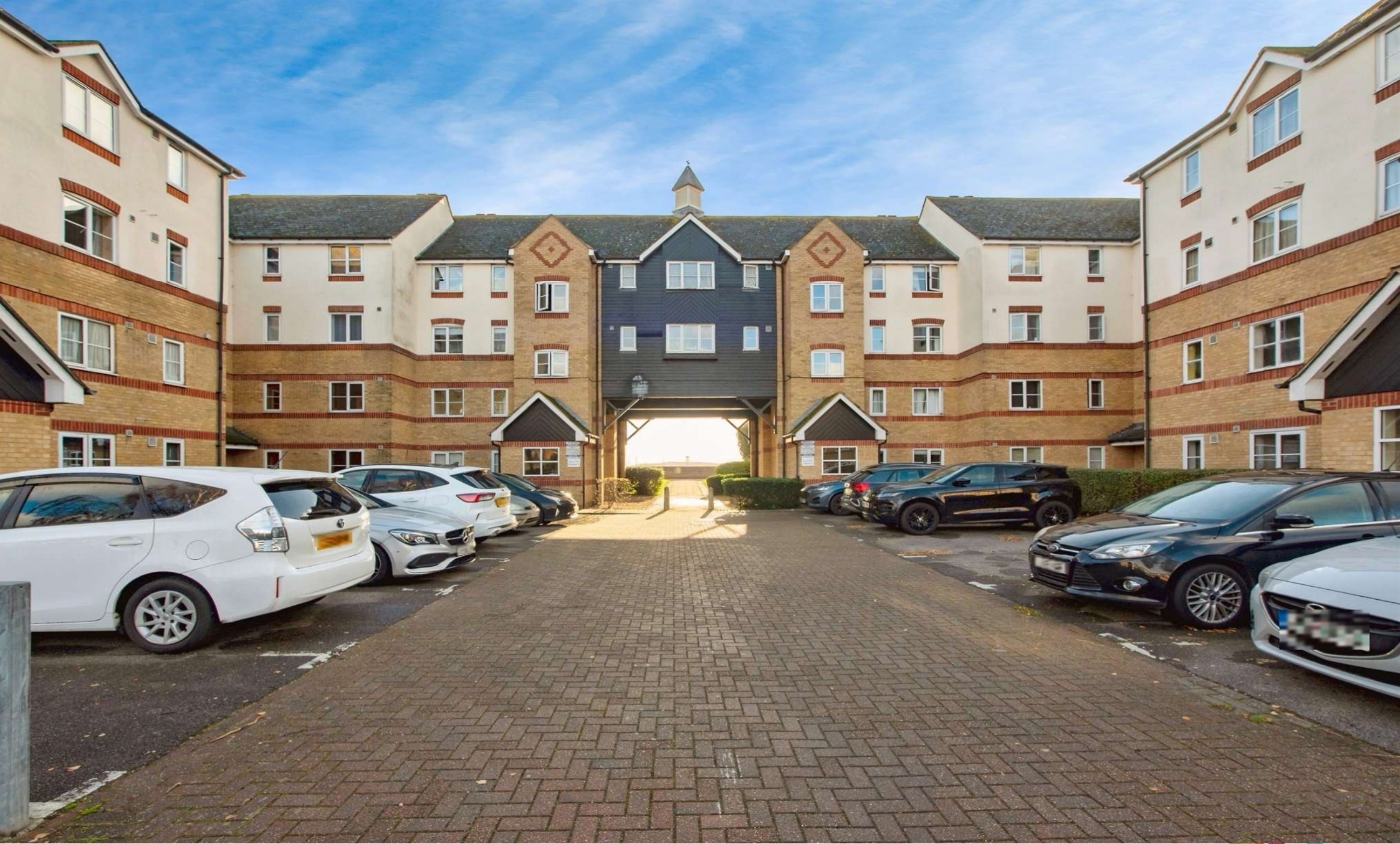
Lewes Close, Grays RM17 6QG