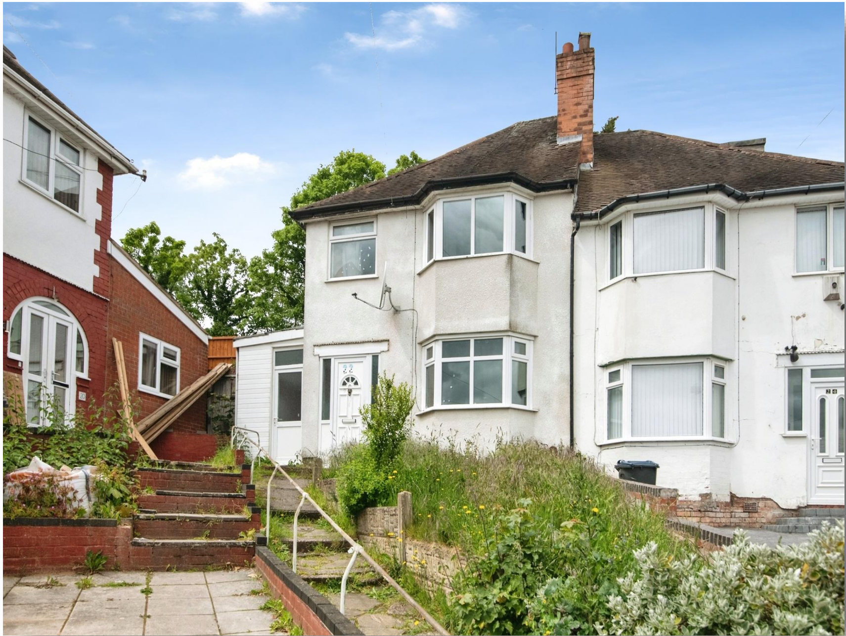
Hylda Road, Birmingham B20 3TU