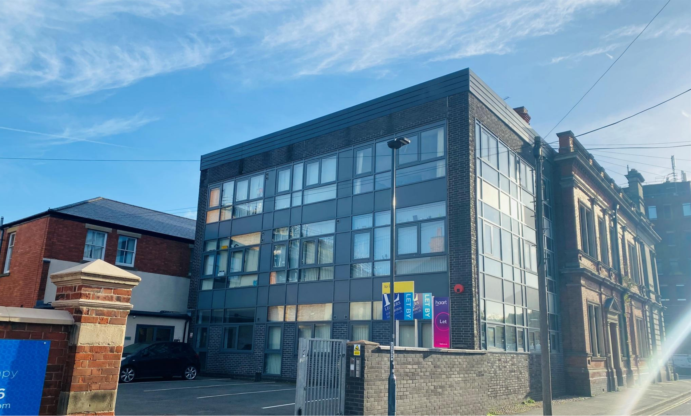
Bramble Court Bramble Street, Derby DE1 1HW