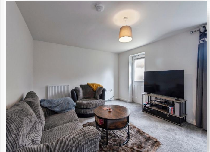
Harvest Mouse Place, Langford, Biggleswade, SG18 9RF