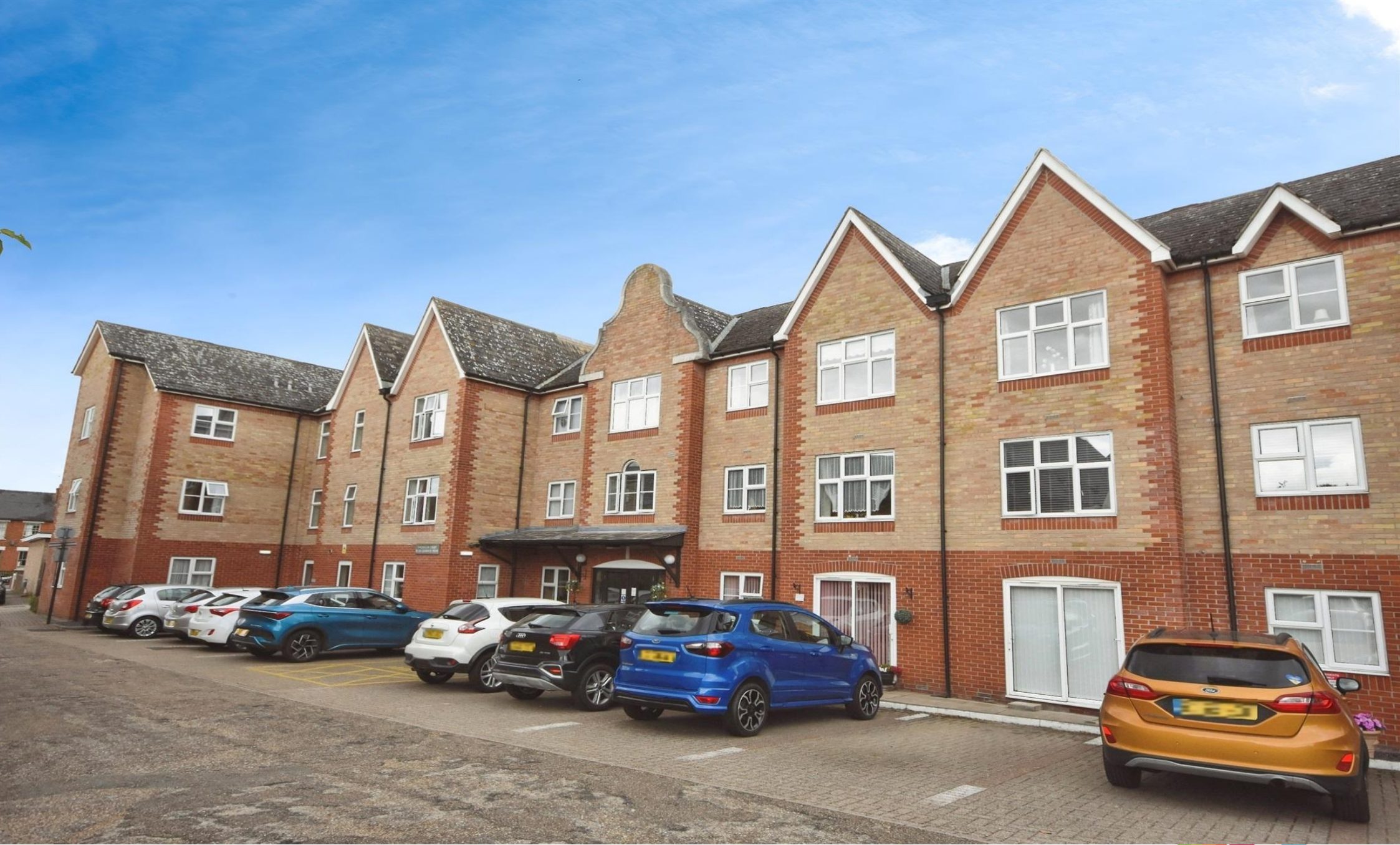
Godfreys Mews, Chelmsford CM2 0XE