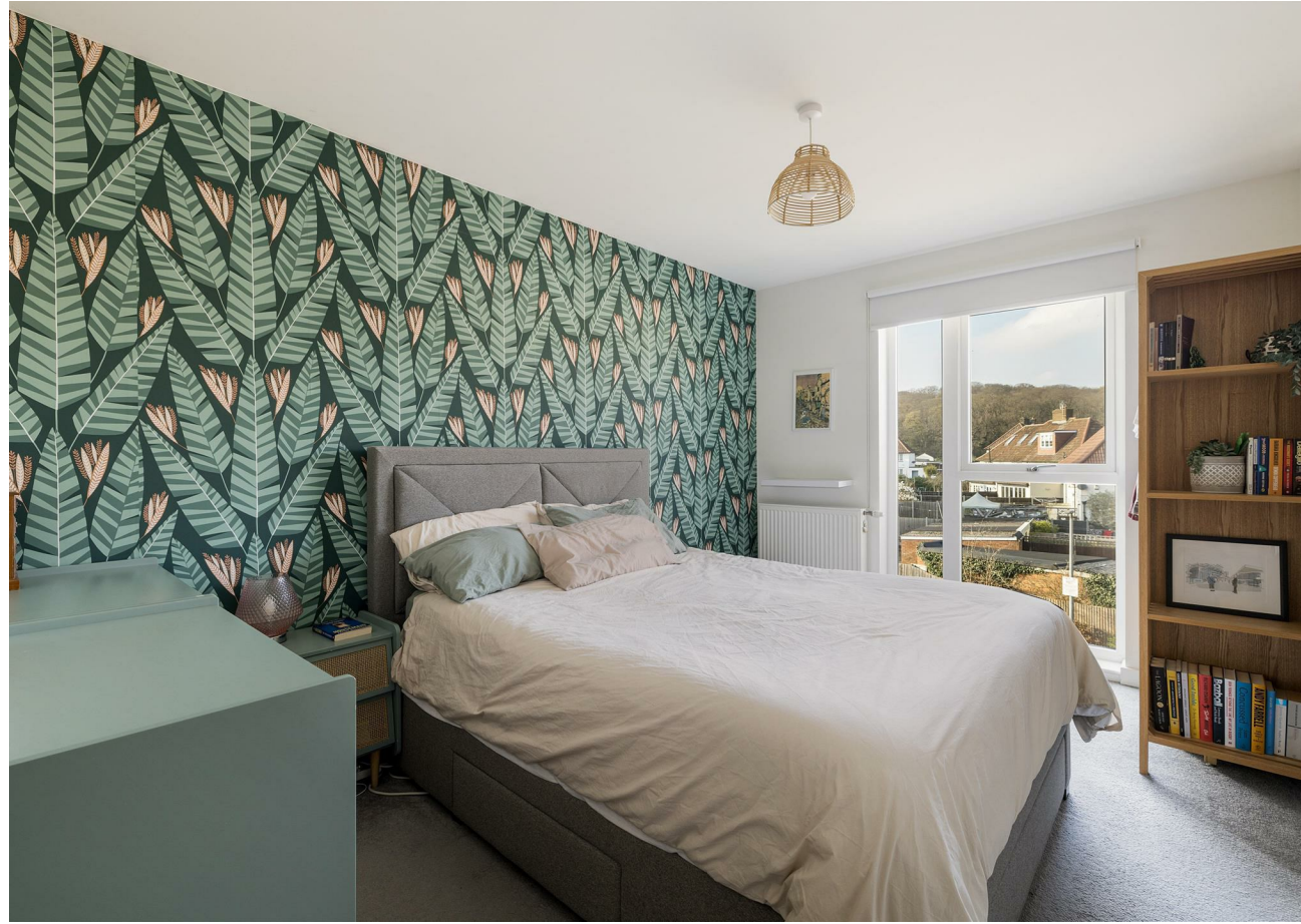
Bedroom 13'1" x 9'6"