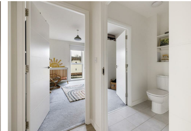
Ensuite 7'0" x 4'11"