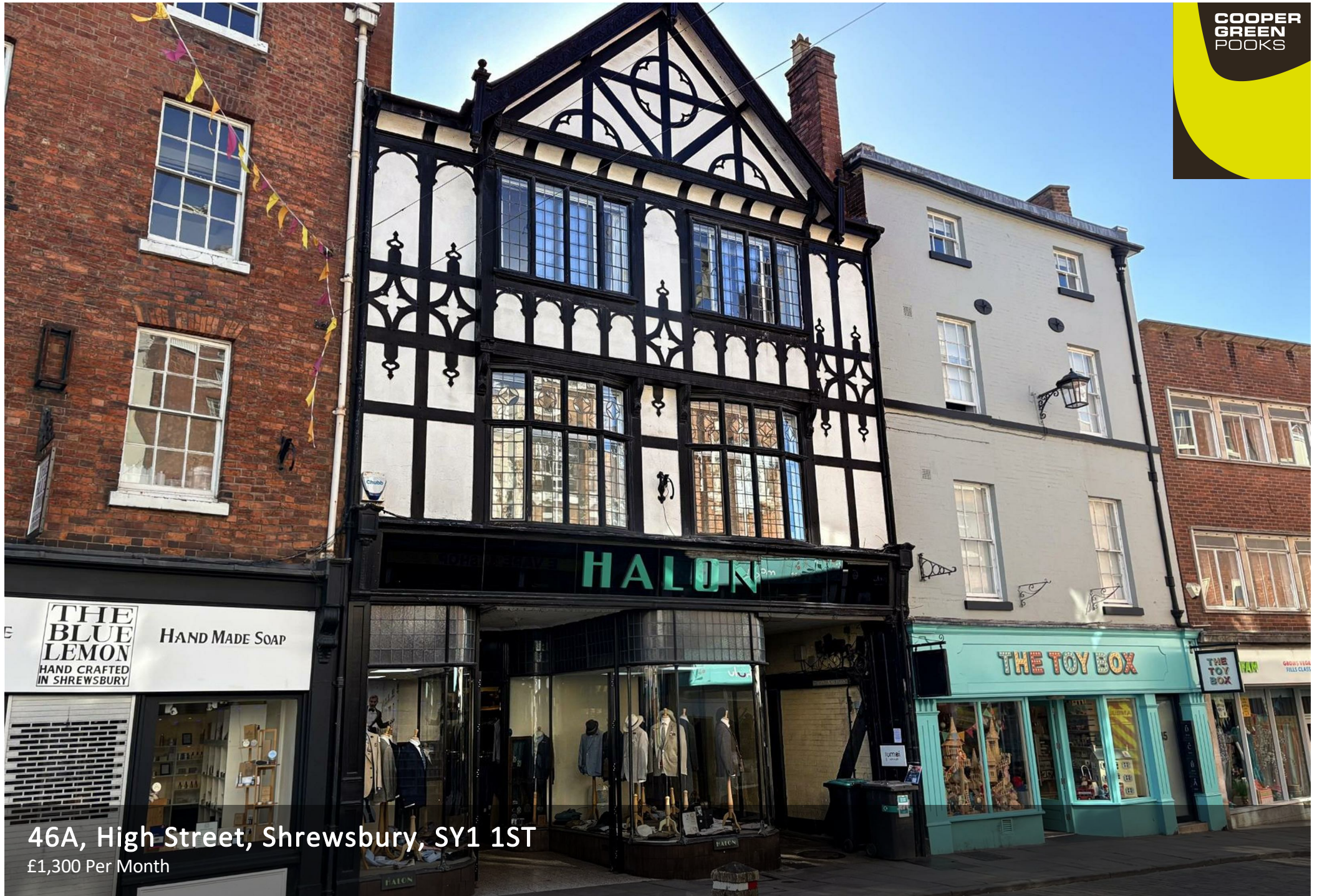
46A, High Street, Shrewsbury, SY1 1ST £1,300 Per Month