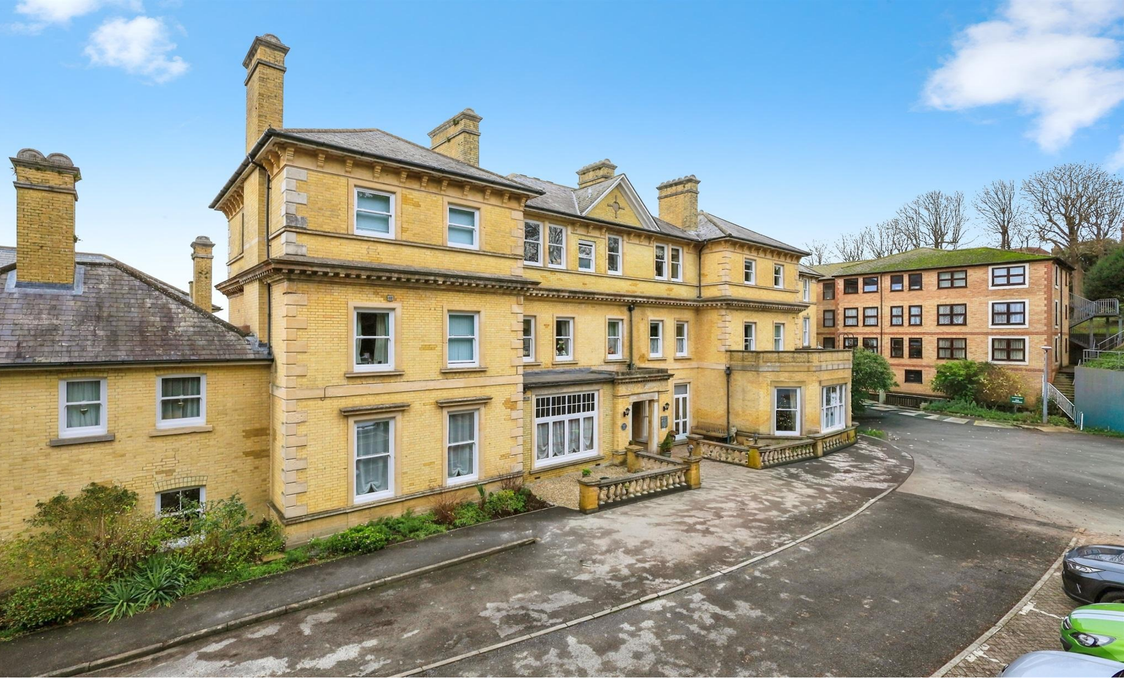
Fairfield Lodge Fairfield Road, Eastbourne BN20 7NF