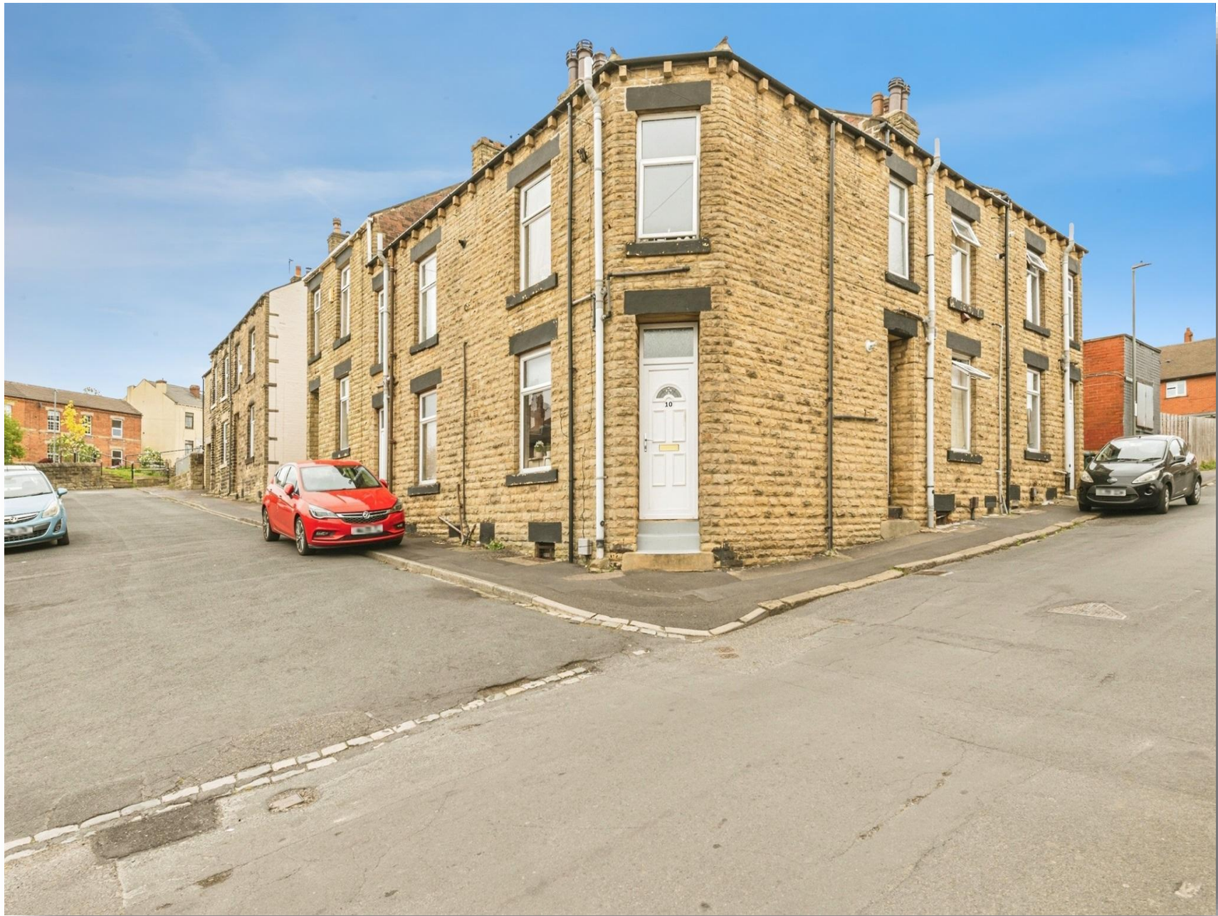
Princess Street, Dewsbury WF12 8QH