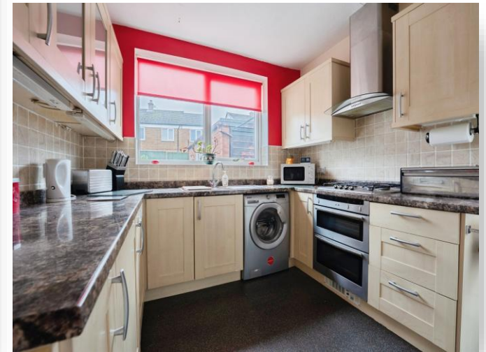
Philips Lane, Great Sutton Ellesmere Port CH66 4TP