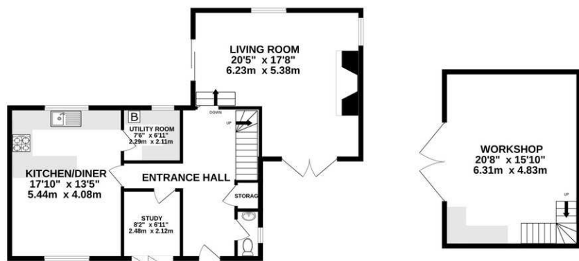
GROUND FLOOR 1145 sq.ft. (106.4 sq.m.) approx.