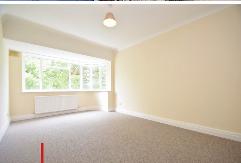
FLAT 19 PENDENNIS BOURNEMOUTH Dorset, BH1 3PU