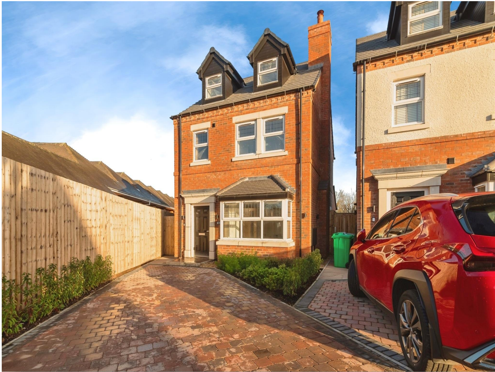
Willoughby Gardens Bridge Road, Wollaton Nottingham NG8 2DG