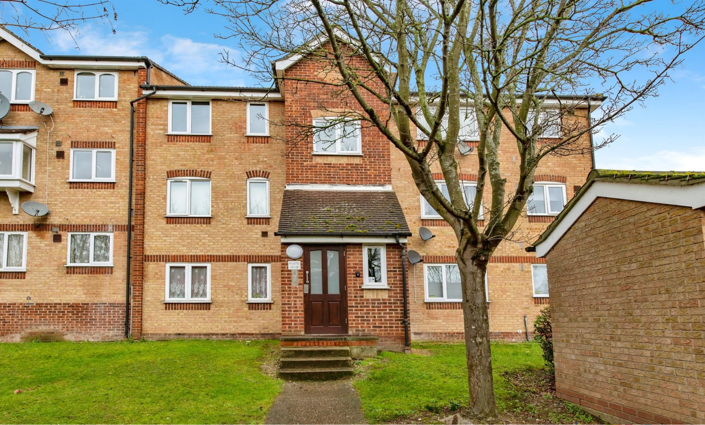
Brighstone Court, Oakhill Road, Purfleet-On-Thames RM19 1TY