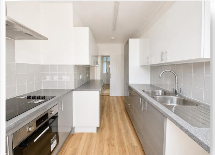
Eastbourne Avenue, Gosport, PO12 4NU