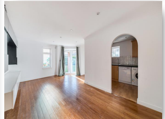
Flat 2 Roman Place, Powney Road, Maidenhead SL6 6EA