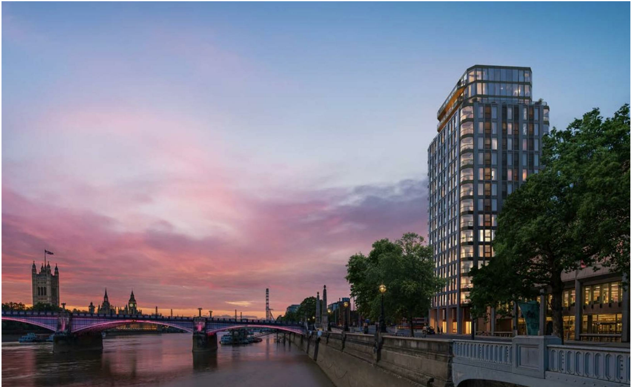
Flat 302, Westminster Tower 3 Albert Embankment, London, SE1 7SP £2,600,000